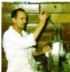
Quality control testing.

When he returned to St. Louis, Missouri, he continued his employment with the Prairie Farms Dairy Company, where he worked for 37 years.